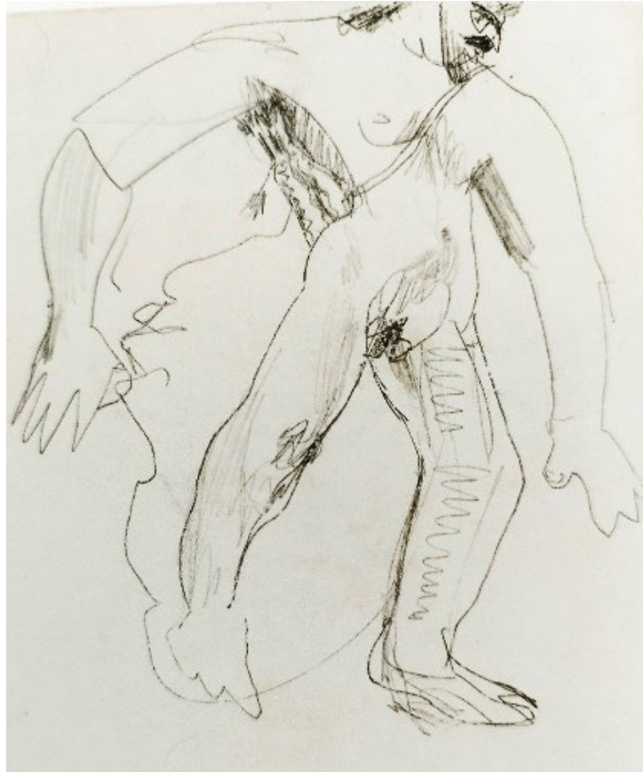
Early sketch of Nimrod, Pencil on paper, 25 x 19 cm, 1930s