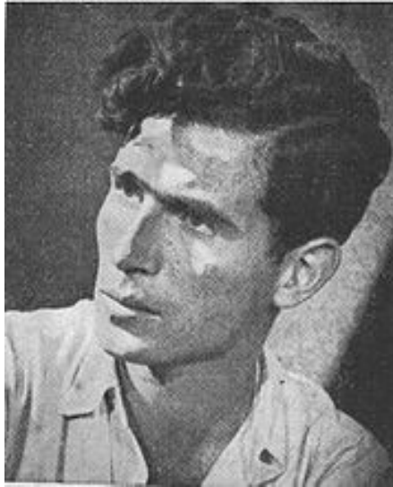
Yitzhak Danziger (1940), 1916-1977, b. Berlin, d. Ramle