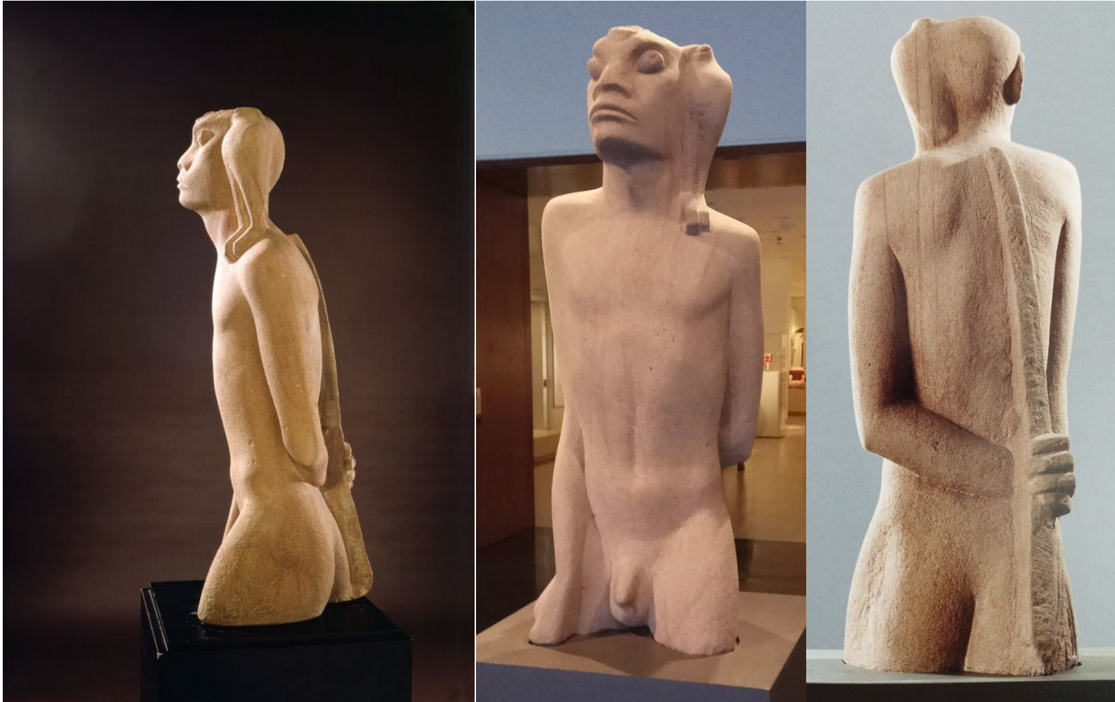
Nimrod, Yitzhak Danziger, 1939 Nubian sandstone, 95 x 33 x 33 cm